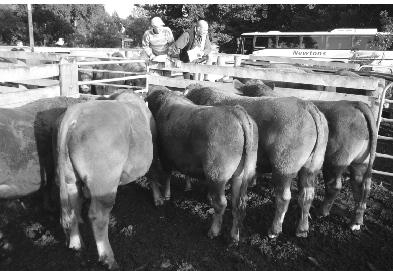
Bulls at Mount Royal