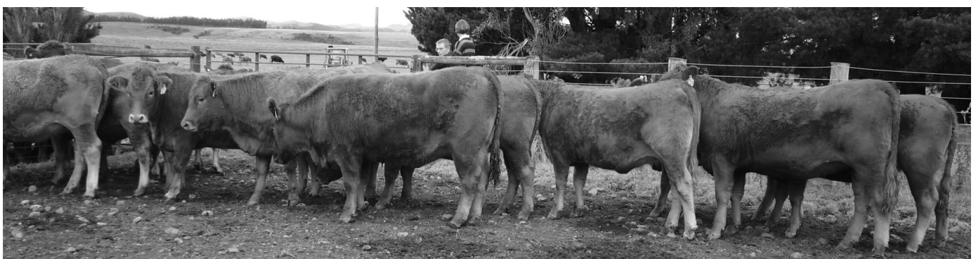
Heifer's at Wainuka Stud

It was an extremely varied and enjoyable three days with time to mix and mingle with those we seldom see. Thank you to the organisers and hosts for a job well done.