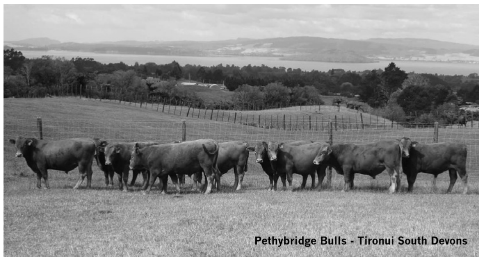
Pethybridge Bulls - Tironui South Devons